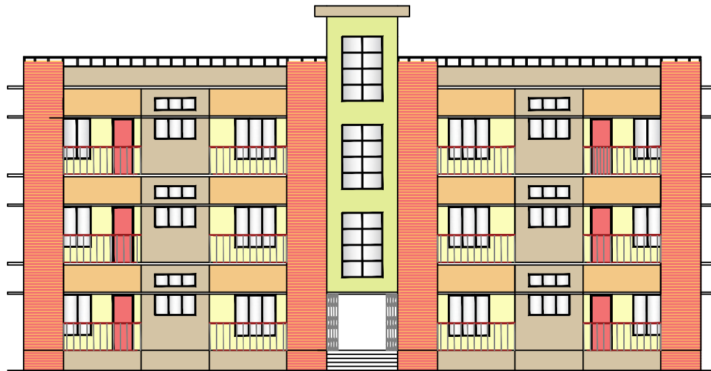
FRONT ELEVATION OF THE PROPOSED G+2 RCC QUARTER